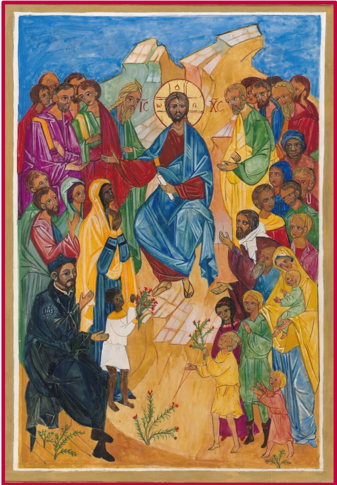
Christ the Teacher